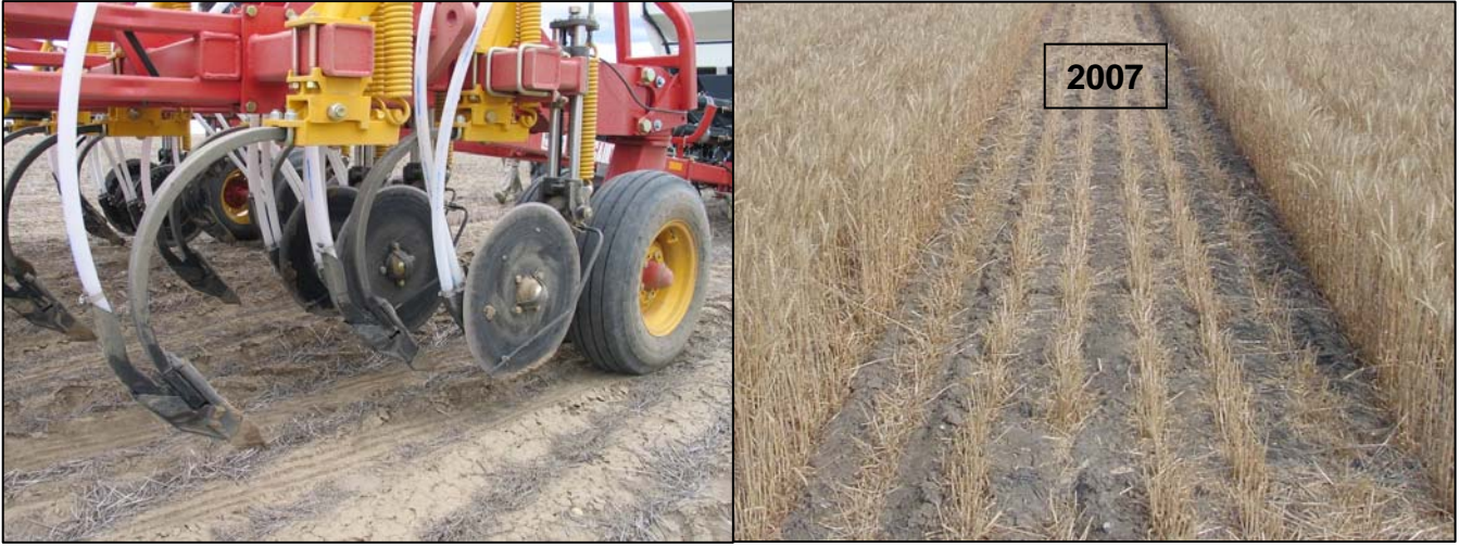
Figure 12. BOURGAULT Dbl-Shoot: 0-40-0 w/Seed+70-0-0 via FertBand (Solid, Seed Band Width = 5.2 Inches)