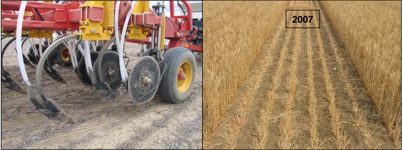
Figure 8. BOURGAULT Sngl-Shoot: 8.5-40-0 w/Seed+61.5-0-0 via PP-Bd'Cst (Solid, Seed Band Width = 3.2 Inches)