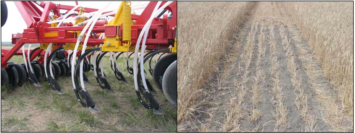
Figure 20. DUTCH Low Draft Dbl-Shoot: 8.5-40-0 w/Sd+61.5-0-0 via FertBnd (Paired/Joined, Band Width = 5.4 Inches)