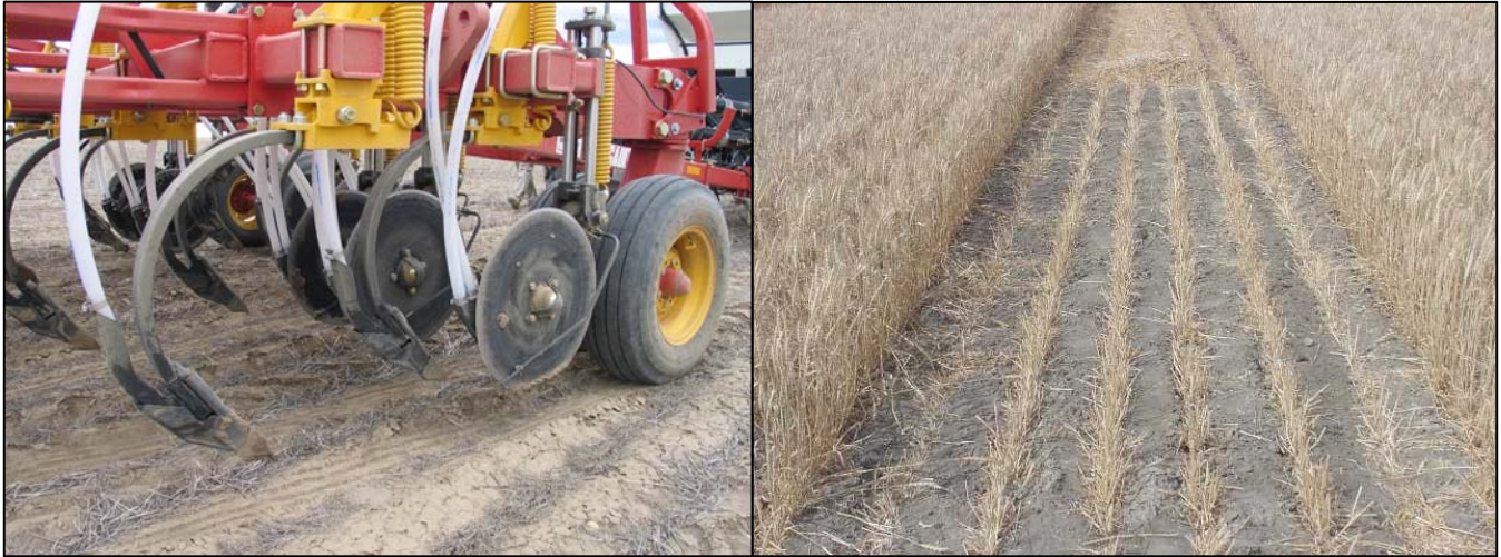
Figure 16. BOURGAULT Sngl-Shoot: 30-40-0 w/Seed+40-0-0 via PP-Bd'Cst (Solid, Seed Band Width = 3.2 Inches)