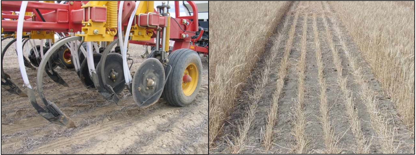
Figure 14. BOURGAULT Single-Shoot: 8.5-40-0 w/Seed+61.5-0-0 via MRBs (Solid, Seed Band Width = 2.7 Inches)