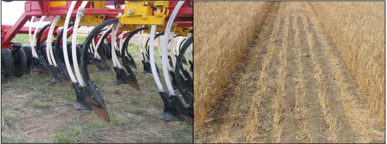
Figure 18. BOURGAULT Dbl-Shoot: 8.5-40-0 w/Seed+61.5-0-0 via FertBand (Solid, Seed Band Width = 5.0 Inches)