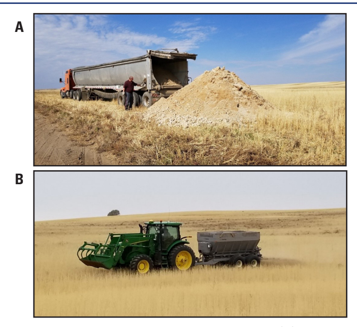
Figure 1. Beet lime was trucked to field locations (A), and then distributed with a Stoltzfus wet-lime applicator (B).